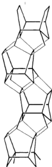
Figure 2: Chain building unit for ZSM-5 zeolite. 4

These SBUs then form long chains (figure 2) which then themselves interconnect to form layers hence giving a unit cell containing eight SBUs figure 3. 4 In 3 one of the chains (shown in figure 2) is highlighted to demonstrate how the chains interconnect to form layers.